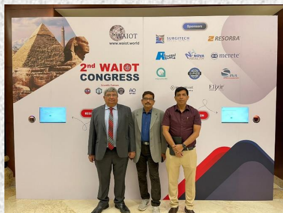
Various Activities in the WOC session of the WAIOT