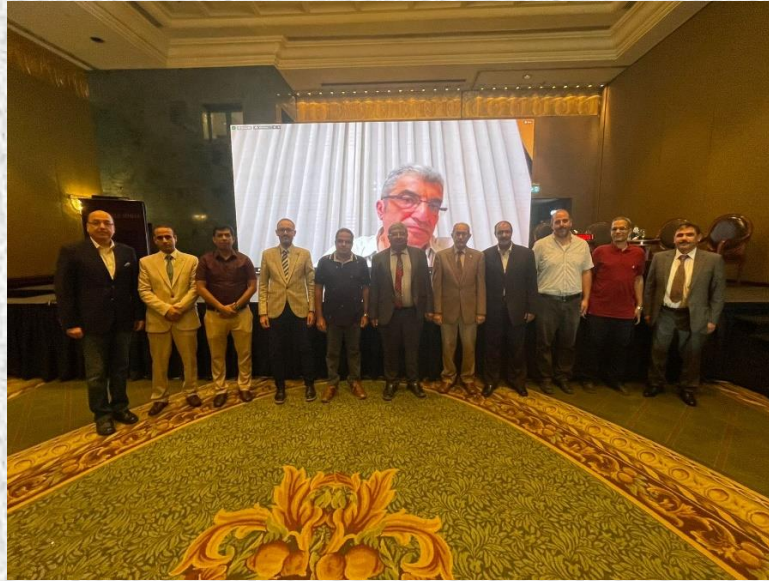
President of WOC giving a virtual talk during WAIOT