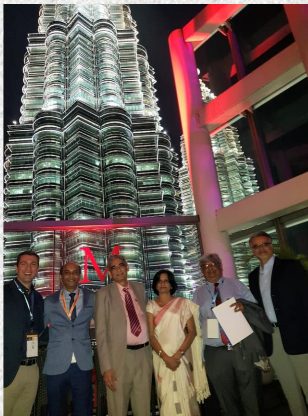
SICOT evenings-after the academics are done!