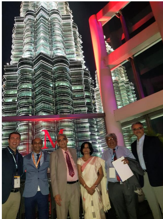
SICOT evenings-after the academics are done!