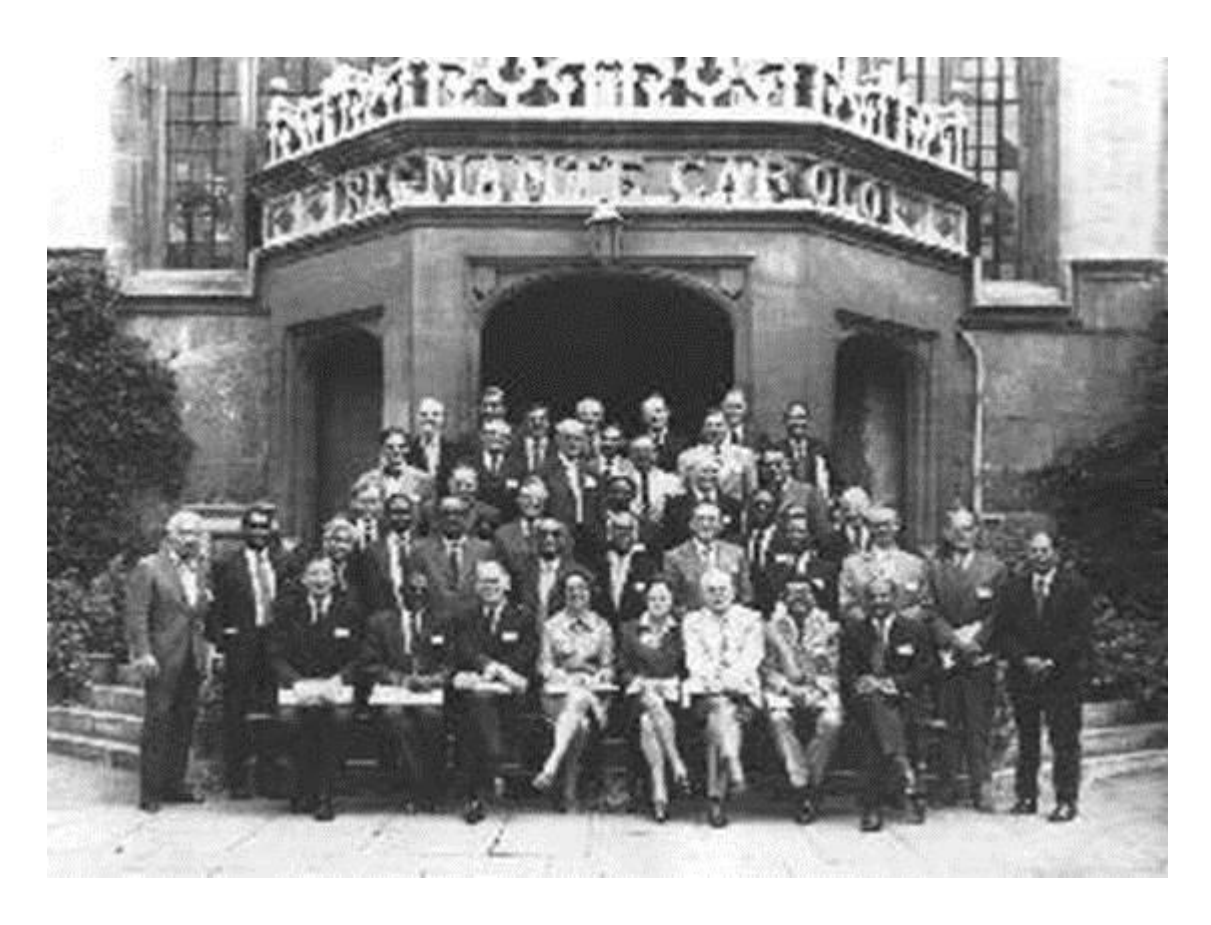
Fig 1. Delegates at the 1973 meeting at Oriel College, Oxford.